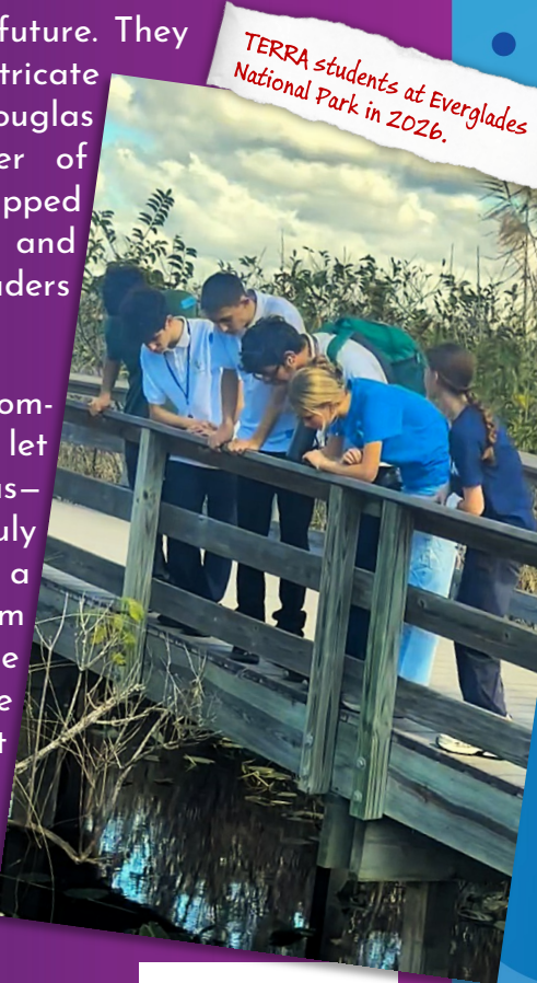
TERRA students at Everglades National Park in 2026.

As we celebrate Women's History Month, let us remember Douglas—a woman who truly provided healing to a damaged ecosystem and promoted hope for a sustainable world, a hope that continues to flourish in the classrooms and field trips of Miami-Dade County Public Schools.