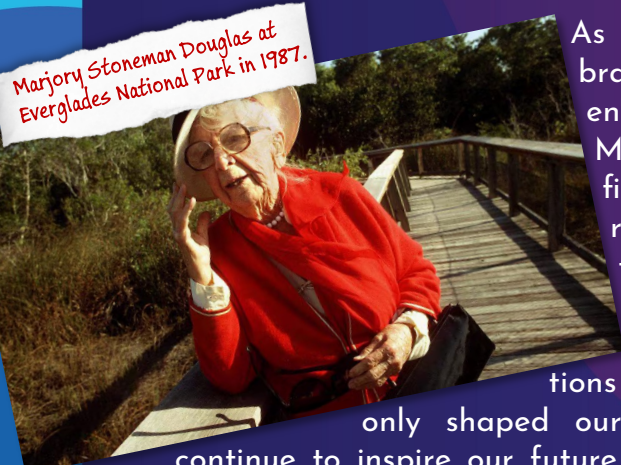
Marjory Stoneman Douglas at Everglades National Park in 1987.

As we celebrate Women's History Month, it's fitting to recognize figures whose contributions have not only shaped our past but continue to inspire our future. This year, as we reflect on the theme of "Women Providing Healing, Promoting Hope," one name resonates profoundly within Florida and beyond: Marjory Stoneman Douglas, who embodies the spirit of healing and hope through her tireless dedication to preserving one of the world's most unique ecosystems. Her legacy continues to thrive, notably through our specialized environmental science programs, like those at TERRA Environmental Research Institute.